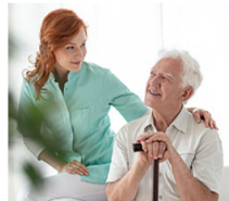
Home Care 4 photos