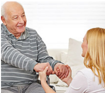
24\7 Support 3 photos