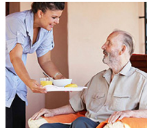
Personal Care 3 photos