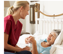
Elder Care 2 photos